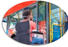
1000 ADA Improvements