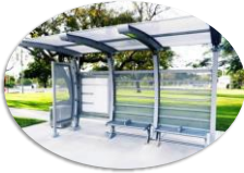
250 New Shelters

Bus Stop Improvement Plan (5 year) & Electrification