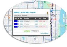
Real Time Info Screens