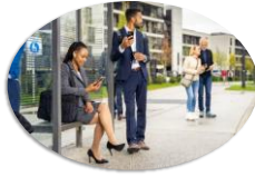
100 Replacement Shelters