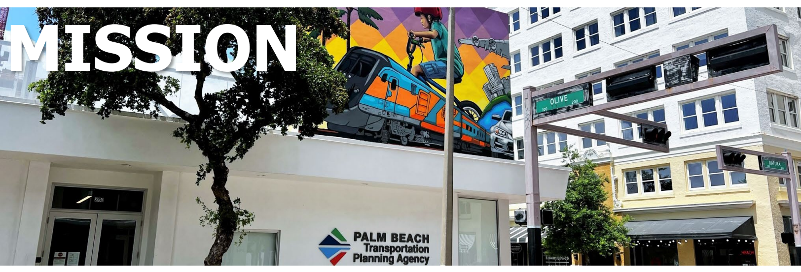
To collaboratively plan, prioritize, and fund the transportation system.

Several benefits are derived from developing and implementing the Strategic Plan. Governing Board priorities are clearly communicated for the TPA Executive Director and staff to follow. Metrics are established for measuring progress on each action and making adjustments to achieve strategic outcomes efficiently & cost-effectively. Transparency and accountability are provided to the public, the partnering organizations, and the member agencies of the TPA.