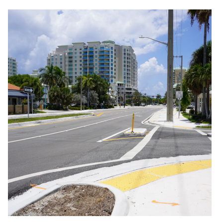
Boynton Beach Blvd.

The first separated bicycle lanes on a FDOT-owned roadway in Palm Beach County are now complete. The TPA worked with FDOT and the Village of Palm Springs to include bicycle and pedestrian improvements for the resurfacing of Lake Worth Rd. from Raulerson Dr. to Palm Beach State College. This project includes level transit boarding, mid-block crossings sidewalk improvements as well as lighting upgrades. $10M of Federal and State funds were prioritized for this project.