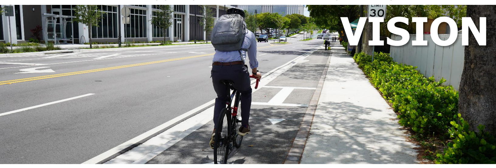
A safe, efficient, and connected multimodal transportation system.