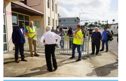
elle Glade West Avenue A Road Safety Audit