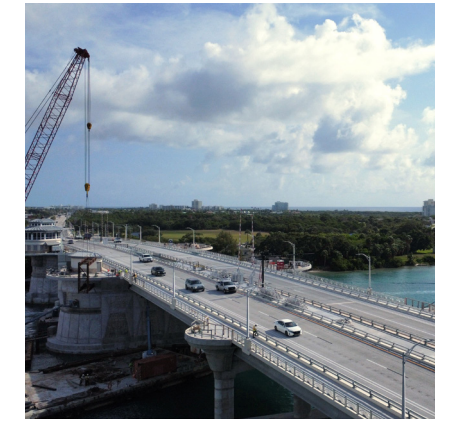
U.S. 1 Bridge