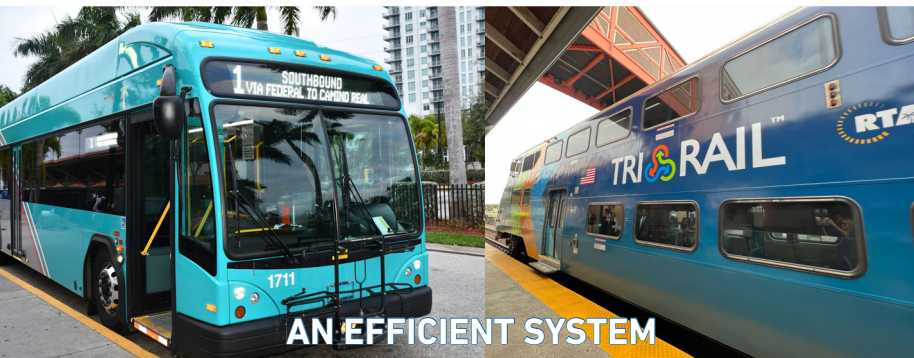
AN EFFICIENT SYSTEM