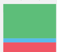
Transit Operations & Maintenance