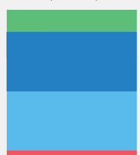
Roadway Operations & Maintenance