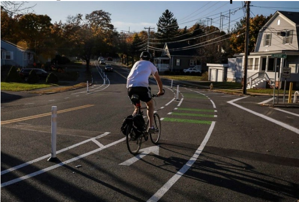
Quick Build Example