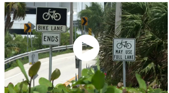
The project will resurface and improve three miles of road.

WPTV's Joel Lopez looked into the multimillion dollar project