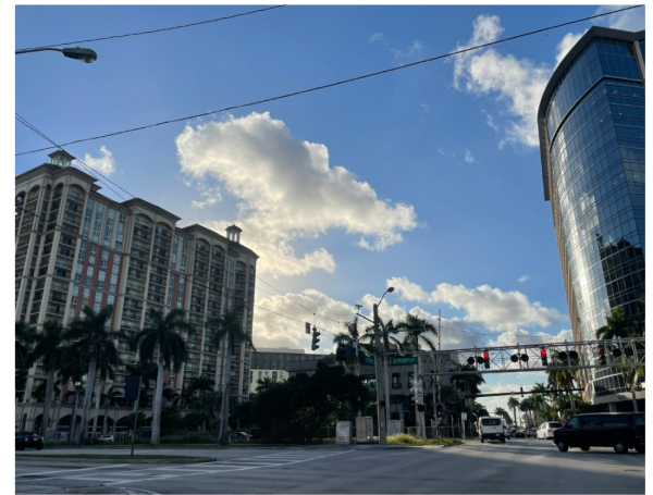
The Palm Beach TPA: Who Are They?

For the most complete information you can visit their website at www.palmbeachtpa.org . From their website their function is summarized: "The Palm Beach Transportation Planning Agency (TPA) is a federally-mandated public agency that works with partners across Palm Beach County, Florida and the United States to plan, prioritize and fund the transportation system. The TPA's mission is a safe, efficient and connected multimodal transportation system for users of all ages and abilities."