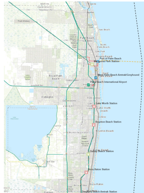
SIS ATLAS LINK