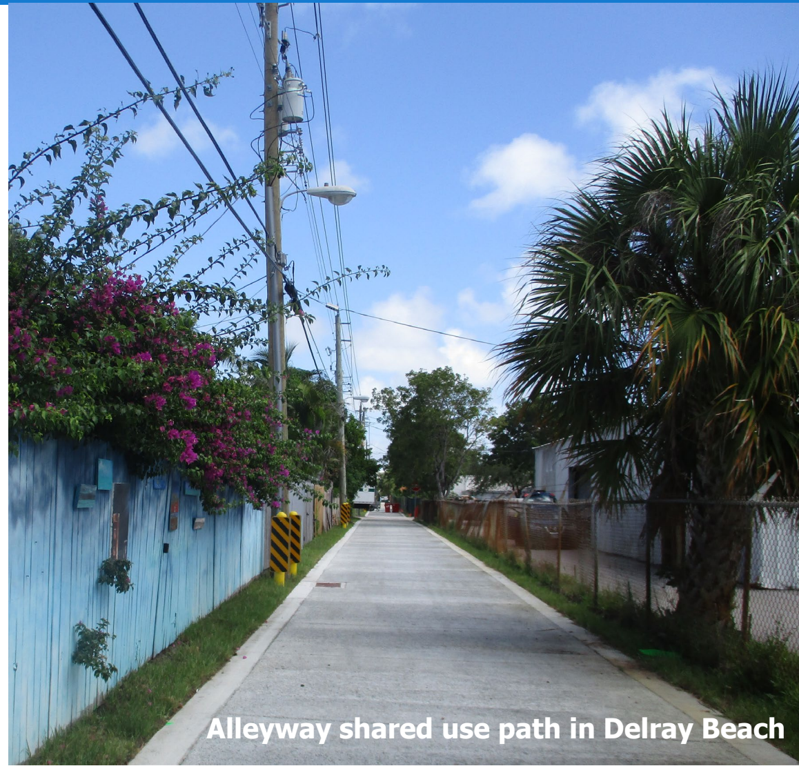
Alleyway shared use path in Delray Beach

3 Year Timeline – Design in year 1 / Construction in year 3