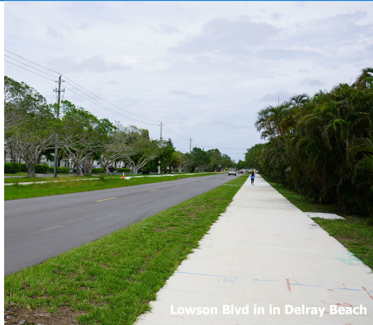
Lowson Blvd in in Delray Beach

5 Year Timeline – Design in year 3/ Construction in year 5