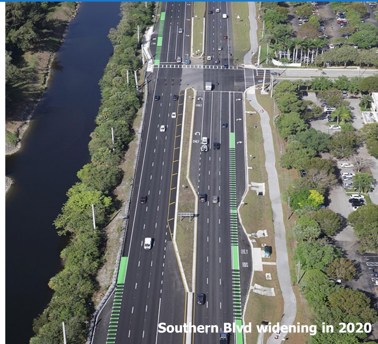
Southern Blvd widening in 2020

5 Year Timeline – New phases typically programmed in new 5 th year