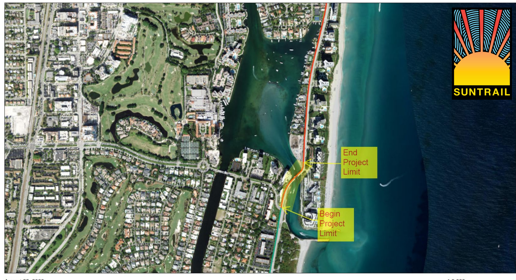
EXHIBIT A A1A - City of Boca Raton