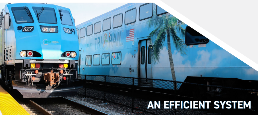
AN EFFICIENT SYSTEM