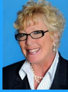
Lake Worth Beach