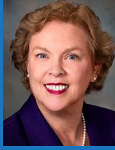
Palm Beach County - Including Palm Tran, SFRTA/Tri-Rail, and PBIA/Airports