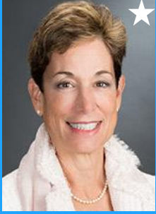
Palm Beach Gardens