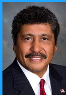
Royal Palm Beach