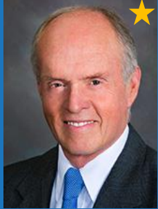
Palm Beach County