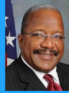
West Palm Beach