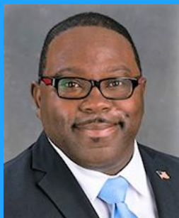
Port of Palm Beach