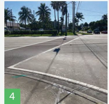
4 Shorten crosswalk distance