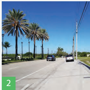
2 Mark paved shoulder as 5' designated bike lane