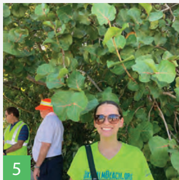
5 Maintain overgrown landscaping