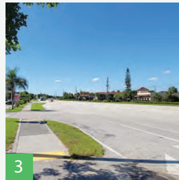
3 Evaluate feasibility of new pedestrian crossing