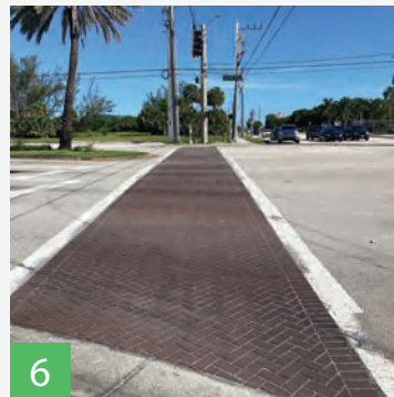
6 Extend median to create a pedestrian refuge island