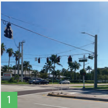
1 Replace missing "No U-Turn" signage