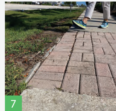
7 Replace raised brick pavers to make sidewalk flat