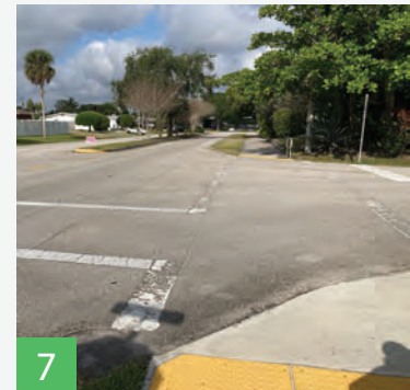
7 Upgrade crosswalks to be marked high visibility

See interactive map of walking audit and findings at: PalmBeachTPA.org/WalkBikeAudits