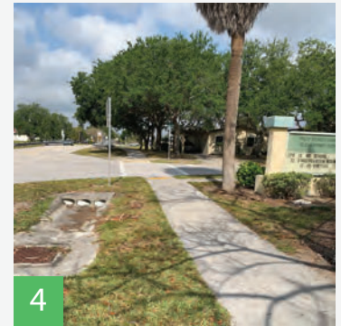
4 Widen sidewalk to shared use path