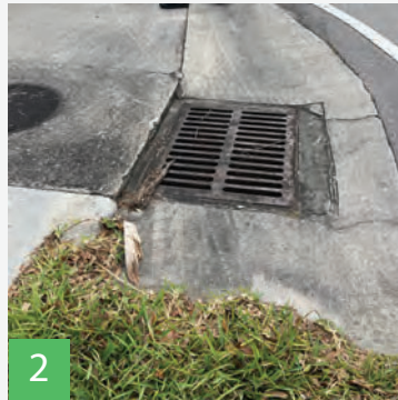
2 Address grade issues with stormwater inlets