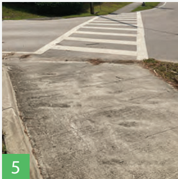
5 Reconstruct pathway to be ADA Compliant