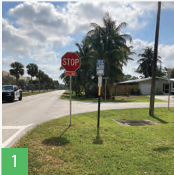
1 Relocate bus stop and make it ADA Compliant