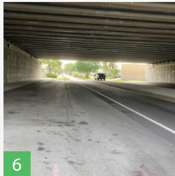
6 Add barrier to mitigate illegal parking from parent drop-off