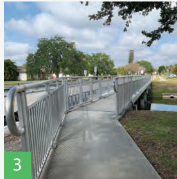
3 Install pedestrian scale lighting along bridge